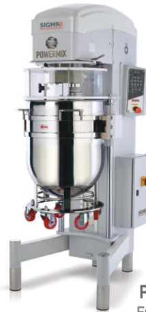
Planetary Mixers POWERMIX From 60 to 160 liters with electronic variator and programmable control panel