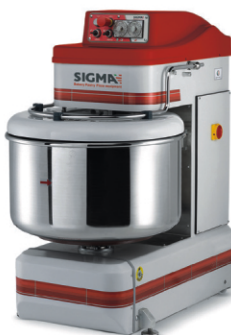
RED LINE Spiral Mixers from 50 to 280 kg