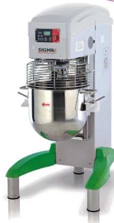
Planetary Mixers CHEF From 7,5 to 60 liters with electronic variator