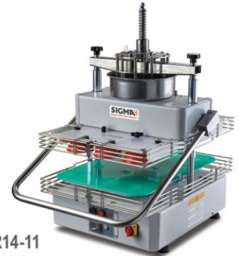
DR14-11 Divider-Rounders for dough ball from 150 to 650 gr