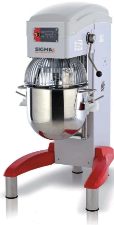
Planetary Mixers BEST MIXER From 10 to 80 liters with mechanical speed variator