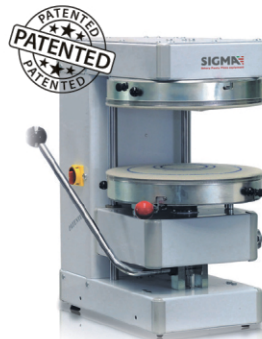
SPRIZZA Cold system pizza spinner