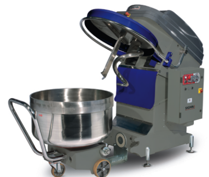
SILVER LINE Spiral mixers with removable bowl from 80 to 300 kg