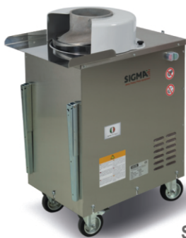
SFERA Screw rounder for dough ball from 50 to 1800 gr